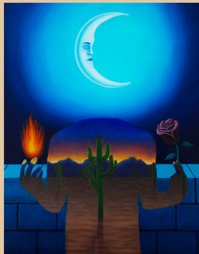
Fernando Cabrera Gonzalez Promises of the Night , 2021 Oil on panel, 20 x 16"