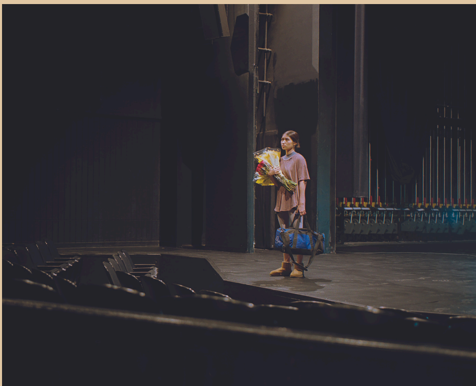
KJ Herb Last Bow , from Prologue series, 2022 Archival inkjet print, 24 x 28"