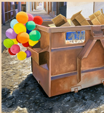
Grace Rhyne, Dumpster , from Trash series, 2023, Oil on canvas, 36 X 24"

Fernando Cabrera Gonzalez , PHOENIX Es la Vida, Más Que la Muerte, La Que No Tiene Límites , 2020 Oil on canvas, 28 x 42"