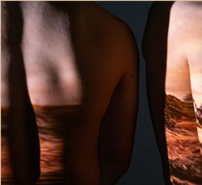
li rothrock kin from ¿Te Ubicas? series, 2020 Archival inkjet print, 15 x 21"