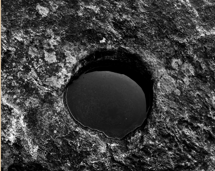
Granville Carroll Untitled , from We Are Made of Many Suns series, 2022, Archival inkjet print, 24 x 30"